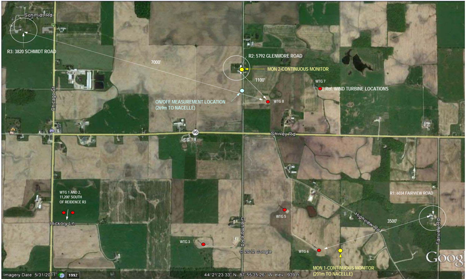
Figure 2.1: Aerial view showing sound survey locations

The four firms wish to thank and acknowledge the extraordinary cooperation given to us by the residence owners and various attorneys.